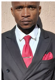
Professor More Candidate Property Practitioner