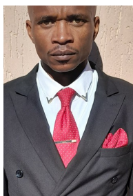
Professor More Candidate Property Practitioner